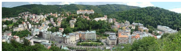
Karlovy-Vary, a mid-sized city in the Czech Republic