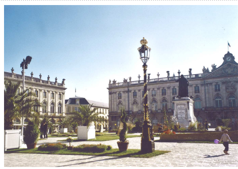
Nancy

The FNAU International Letter is able to announce already now to its readers that the next Biennial will be held in Nancy (France) in 2009 over the following topic : Which place for the mid-sized cities within Europe ?